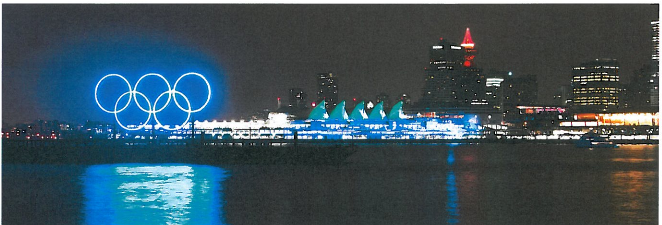
Vancouver's 2010 Olympics were a great international success.

A World Class Convention Centre. Our award-winning, world class Vancouver Convention Centre will serve as one of the most beautiful venues to ever host a World Congress of Dermatology. The Centre is one of the 2010 Olympic infrastructure legacy projects, and is situated on the waterfront in the heart of downtown Vancouver. Participants will enjoy stunning views of the harbour and mountains as they move between their sessions. This brand new, state of the art facility will support the latest technology to ensure that programs will be interactive and provide complimentary WiFi to keep everyone connected. Smartphone technology and specialized iPhone apps will help delegates make the most of their WCD experience, while providing a new dimension for lively and instantaneous interactions that will go beyond traditional PowerPoint and microphones. We are lucky to be able to boast that the Vancouver Convention Centre is within walking distance to a spectacular variety of accommodation, dining, shopping, tourist attractions and transit.