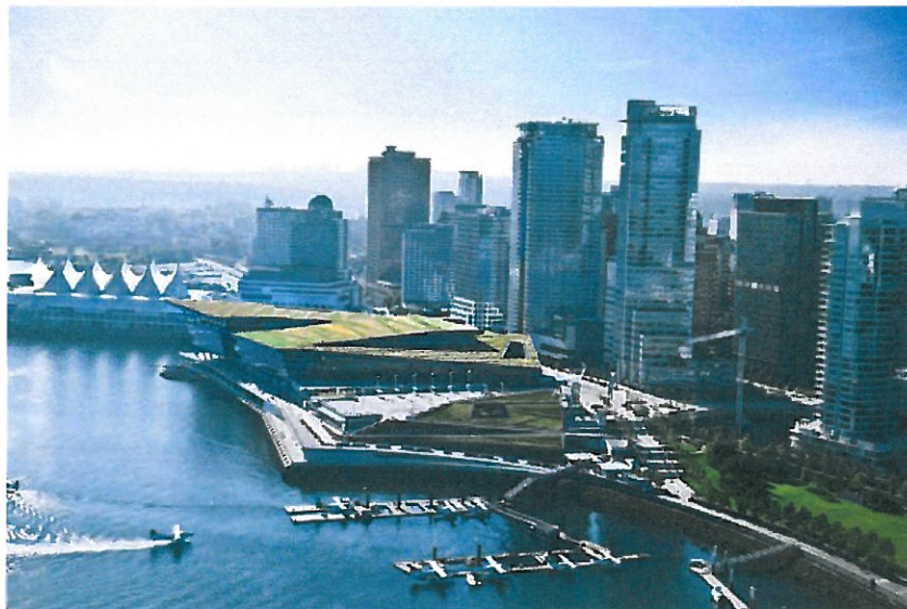
Vancouver's Convention Centre is located right on the waterfront.

A World Class Convention Centre. Our award-winning, world class Vancouver Convention Centre will serve as one of the most beautiful venues to ever host a World Congress of Dermatology. The Centre is one of the 2010 Olympic infrastructure legacy projects, and is situated on the waterfront in the heart of downtown Vancouver. Participants will enjoy stunning views of the harbour and mountains as they move between their sessions. This brand new, state of the art facility will support the latest technology to ensure that programs will be interactive and provide complimentary WiFi to keep everyone connected. Smartphone technology and specialized iPhone apps will help delegates make the most of their WCD experience, while providing a new dimension for lively and instantaneous interactions that will go beyond traditional PowerPoint and microphones. We are lucky to be able to boast that the Vancouver Convention Centre is within walking distance to a spectacular variety of accommodation, dining, shopping, tourist attractions and transit.