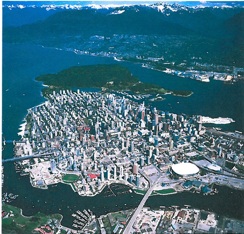
Vancouver – a modern city with strong links to the past.

Vancouver – Accessible, Affordable, and Available. Vancouver is modern highly accessible destination, and over 90% of Congress delegates will arrive either on direct flights or within one airline connection. An efficient subway system connects the Vancouver International Airport to downtown hotels in only 20 minutes for the low cost of $8.75. Vancouver citizens live and work in the downtown core, so no matter what the time of day, the city is alive and safe with people, energy, and excitement. The distance from one end of the downtown core to the other end is only 1.5 kilometres (1 mile); less than half an hour anywhere by foot! With over 13,000 hotel rooms situated in this downtown core, participants will be able to walk to the Congress site or take a quick shuttle bus. Whether it's food, lodgings, or fun, Vancouver can easily meet the needs of the budget-conscious, or those seeking to satisfy special indulgences. It's really no surprise why so many people who visit Vancouver wish to live here forever.