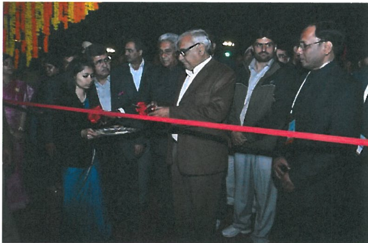
Inauguration of Trade Exhibition by Hon Chief minister of Haryana