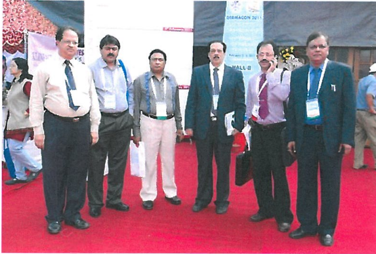
DERMACON- Annual conference of IADVL at GURGAON, Haryana